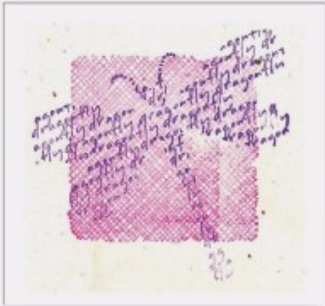
Brooker Stamp Card