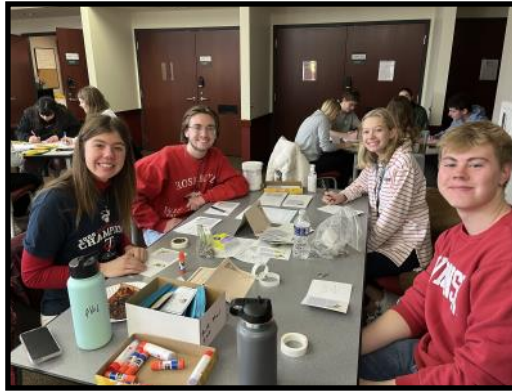
Volunteers Signing Cards

In November 2022, over 30 students from the University of Wisconsin Madison School of Business teamed up to help support The Dragonfly Project. We had 23 student volunteers on Friday and 31 on Saturday of the event. Students learned about the history of the impactful organization by first watching a video, then groups worked together to assemble keychains and create card packets. Each packet had a card with the dragonfly story and a dragonfly keychain with it. Finally, they sorted over 425 card packets by zip codes. It's amazing to think of how many people touched different stages of each card that will bring hope to someone grieving after losing a loved one. A whole community of love is being sent with each card.