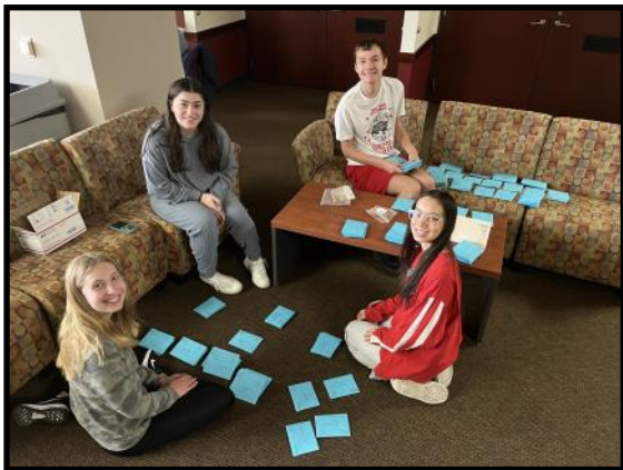
Sorting Zip Codes for Mailing

This service project was a really great way to introduce a new organization to many young students. Several of them expressed how passionate they were about The Dragonfly Project’s mission and that they wanted to get more involved in the future. The gift of hope given by the volunteers was also received in their own hearts.