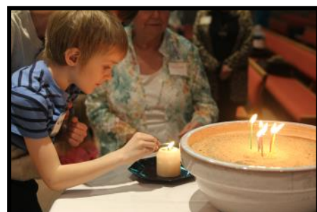
Candle Lighting Ceremony

Videos of the annual celebration and the photo montage are available on our website as well as a PDF of the program that has more information.